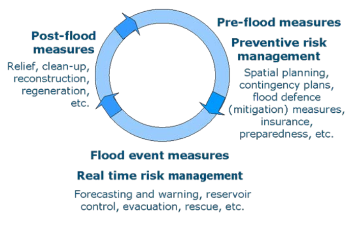
Figure 1: The risk management cycle

I hope these general areas are sufficiently generic to encapsulate the actions needed for flood risk management whatever the social and economic factors are in different countries; however, I would first like to identify the importance of data in supporting this R&D.