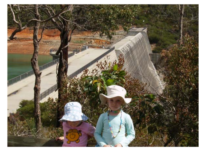
Figure 7: New Victoria dam, Australia. In the foreground: the next generation of dam engineers?