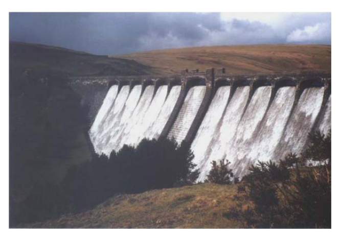
Figure 5: The Claerwen dam, which supplies water to Birmingham, UK