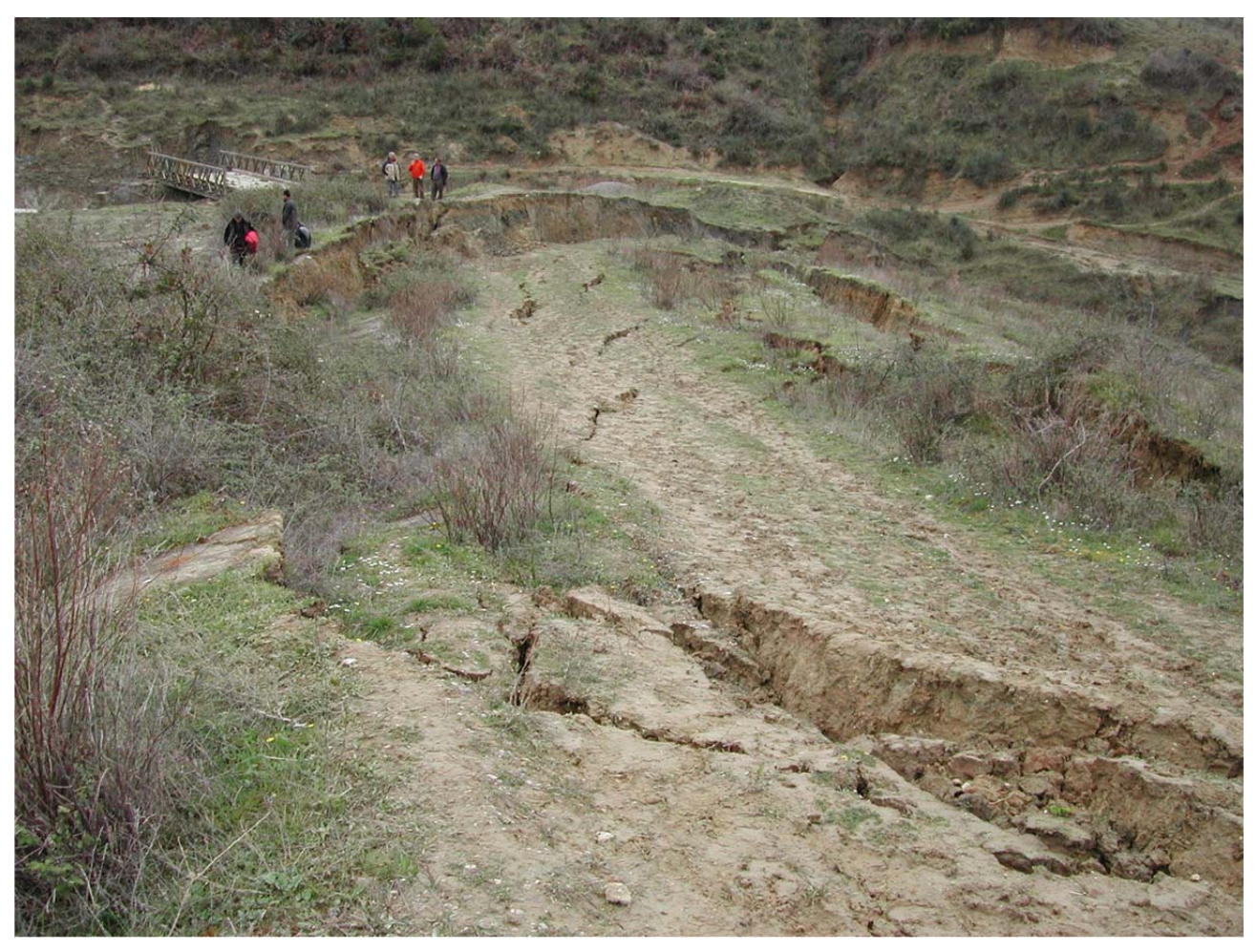
Figure 11: The Sharredushk dam in Albania

The owners of the restaurant in Albania had obviously carried out careful hydrological analyses before deciding to site their restaurant in the spillway at Sharge reservoir!