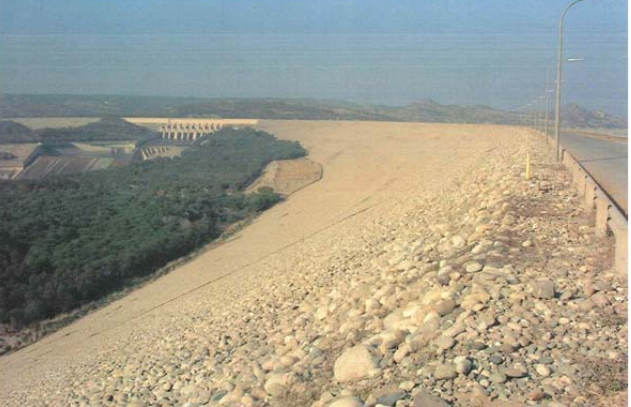
Figure 2: The 148 m-high Mangla dam, Pakistan, completed in 1967 and recently heightened