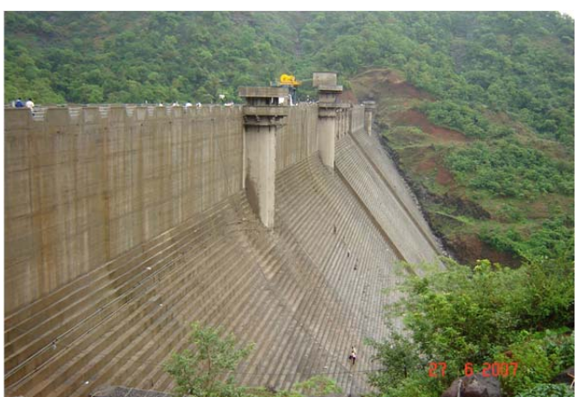
Figure 4: The Lower Ghatghar RCC dam in India, which forms the lower reservoir for a 250 MW pumped-storage scheme