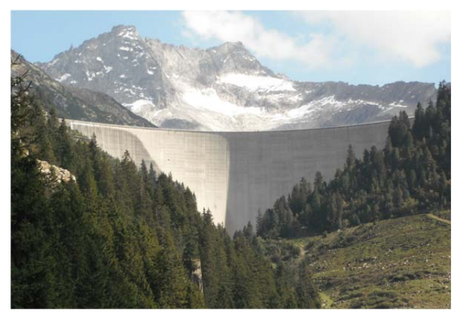
Figure 3: The 186 m-high Zillergrűndl dam in Austria