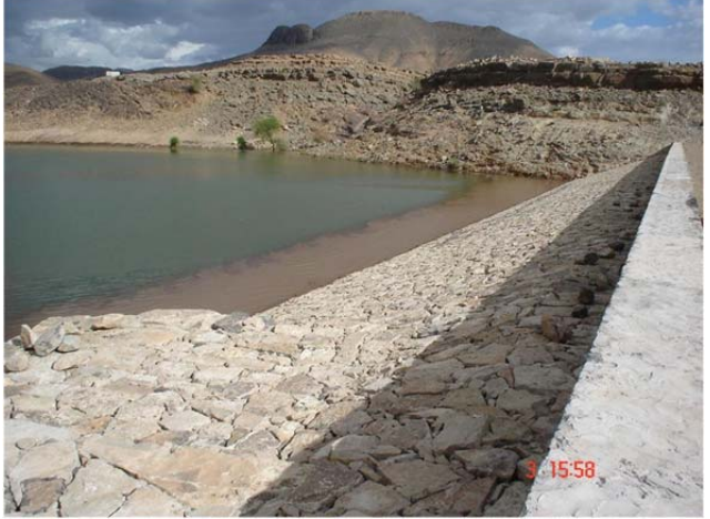
Figure 8: Bani Naji dam in Yemen.

As well as surface water, there is the hugely important issue of groundwater. In many parts of India, Pakistan and China the water table is sinking at a rate of 1-2 m/year. In Sana'a in Yemen, the aquifer is now 200 m deep and falling fast. The city is 2100 m above sea level so desalination of seawater is not an option. I have, in the past, suggested the treatment of Sana'a wastewater which is at present polluting the aquifers, but which could be used for irrigation, recharging the aquifers or even (if the quality of treatment could be guaranteed) for domestic supply.