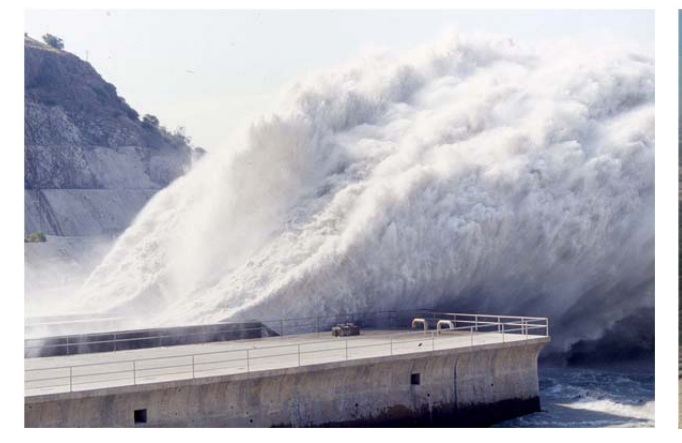
Figure 1: One of the irrigation outlets discharging at the Tarbela dam in Pakistan