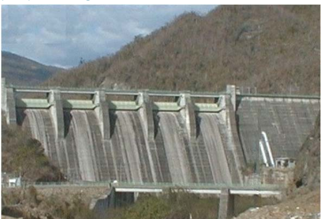
Figure 5: The Claerwen dam, which supplies water to Figure 6: Valdesia dam in the Dominican Republic