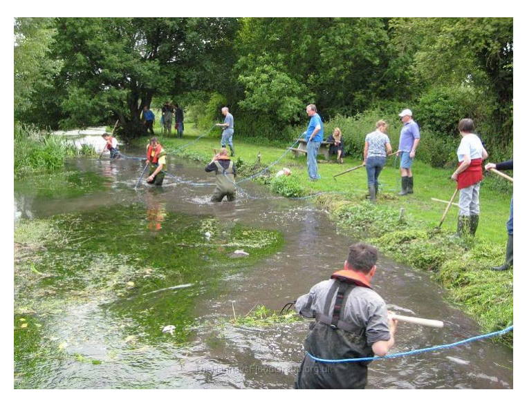
Figure 4: Vegetation clearance of Letcombe Brook, Oxfordshire. UK, by members of Hanneys Flood Group Summer 2008

In the case of the Hayling Island Group, hessian bags were provided by the EA. The local farmers covered the cost of the cement and ballast and provided the small mechanical handler for mixing and helping to move the sand bags, including up onto the crest of the wall.